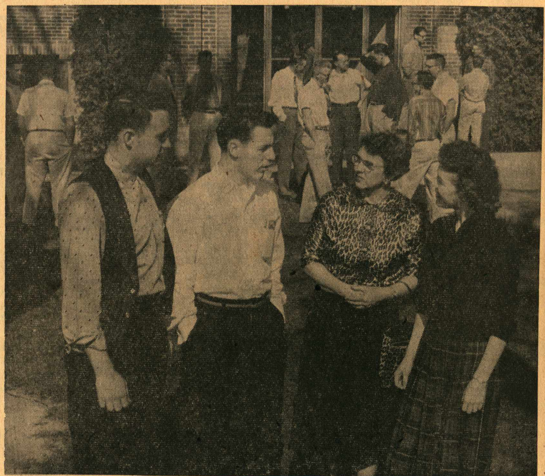
"WASN'T THAT a hard one!" "That one was easy for me." Who knows what discussions are going on in these buzz groups during a break in testing periods last weekend. Seniors took the graduate record tests and sophomores took area tests of the graduate record series.