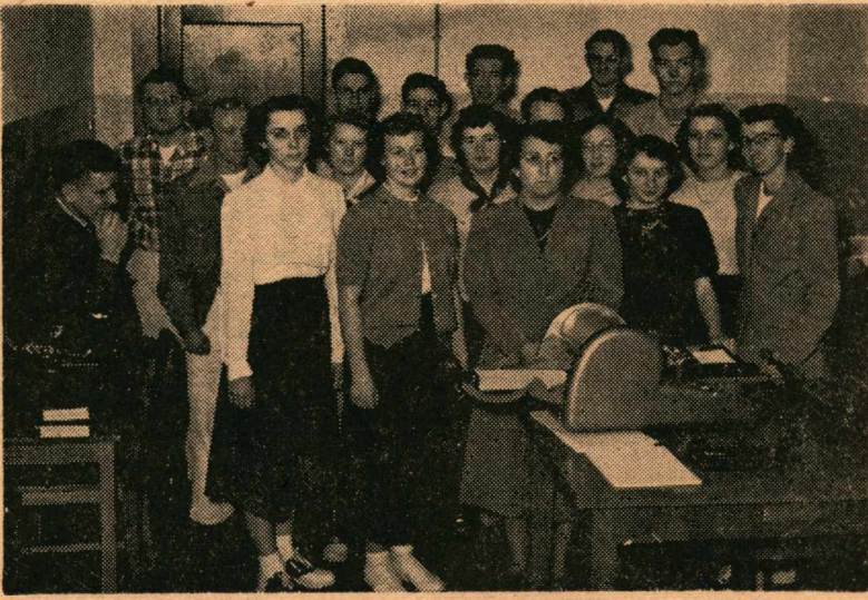
Business majors and secretarial certificate majors are pictured above with instructors in the business administration department.