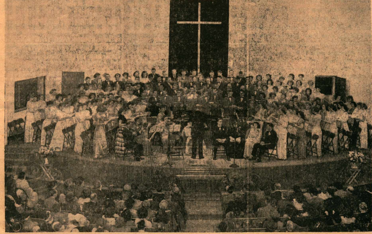
Philharmonic choral group presents the Messiah.