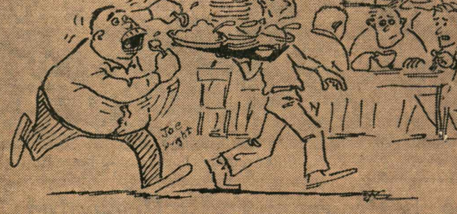
"The biggest chow-hound I have ever seen."

Published bi-weekly during the school year by the students of Northwest Nazarene College, Nampa, Idaho, reflecting their views and opinions, not necessarily those of Northwest Nazarene College.