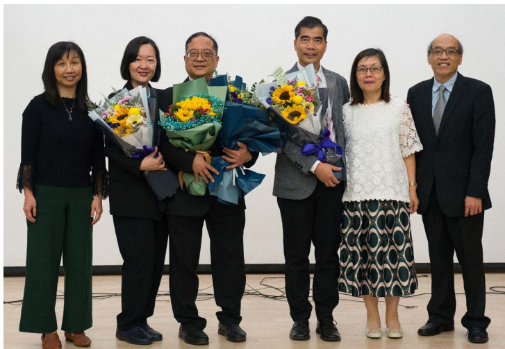
New ordinands—first in ten years.