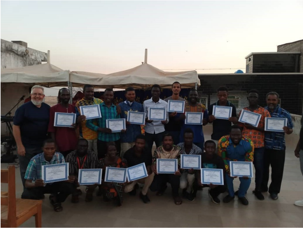
Training of workers from Senegal, Guinea Bissau, and Gambia in church planting and mentoring