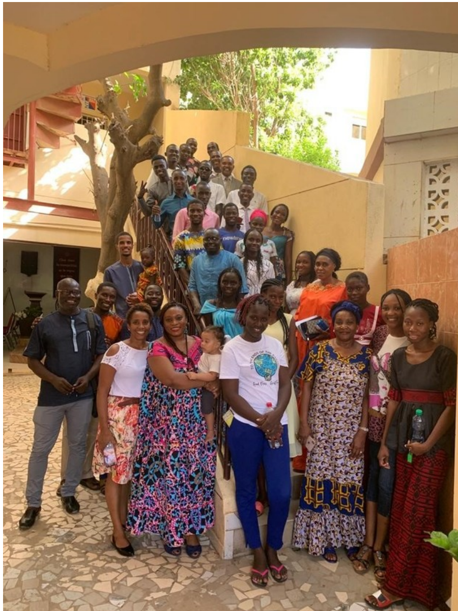
2022 District Assembly

Is God calling you to participate? For more information, click here .