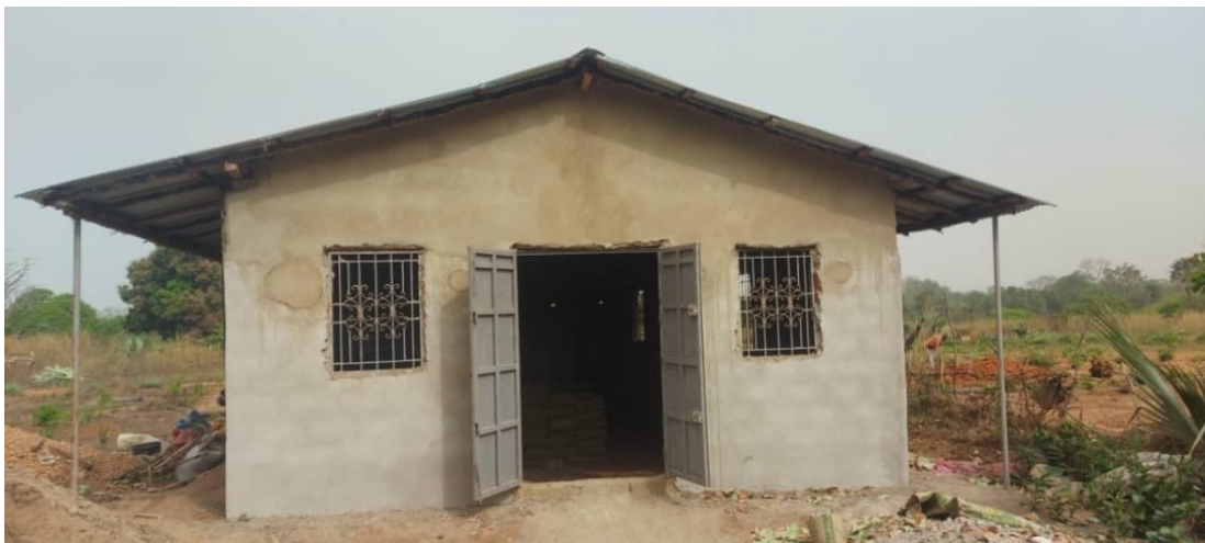
Church of the Nazarene in Adéane, under construction