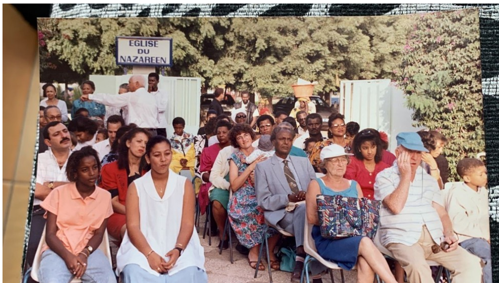
A "backyard service" of the Church of the Nazarene, Baobabs, in 1992