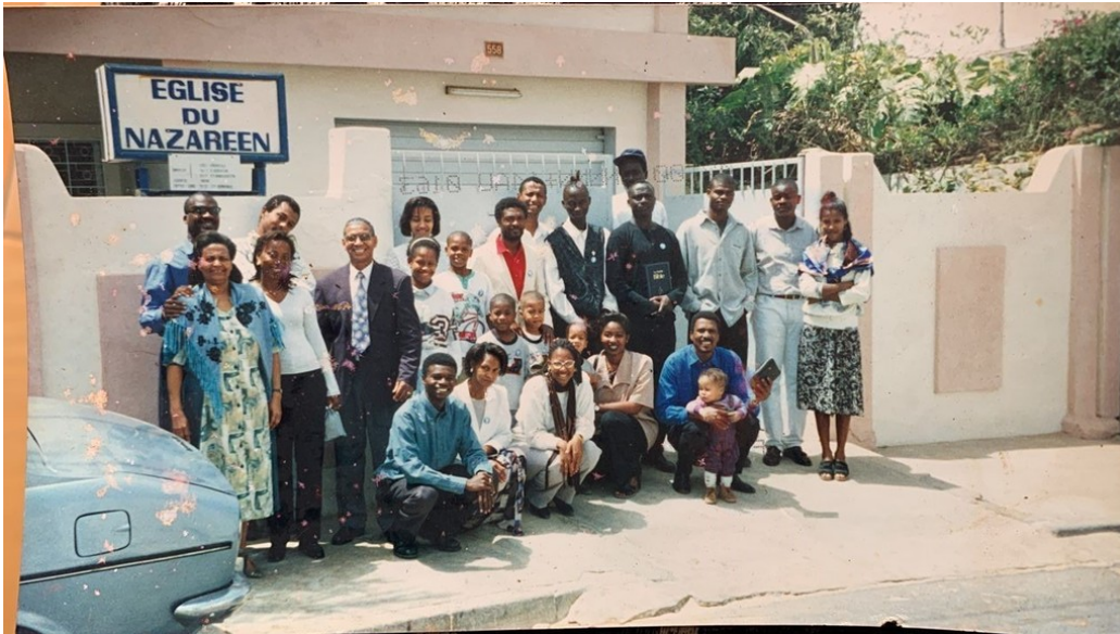
The congregation of the Baobabs Church of the Nazarene.