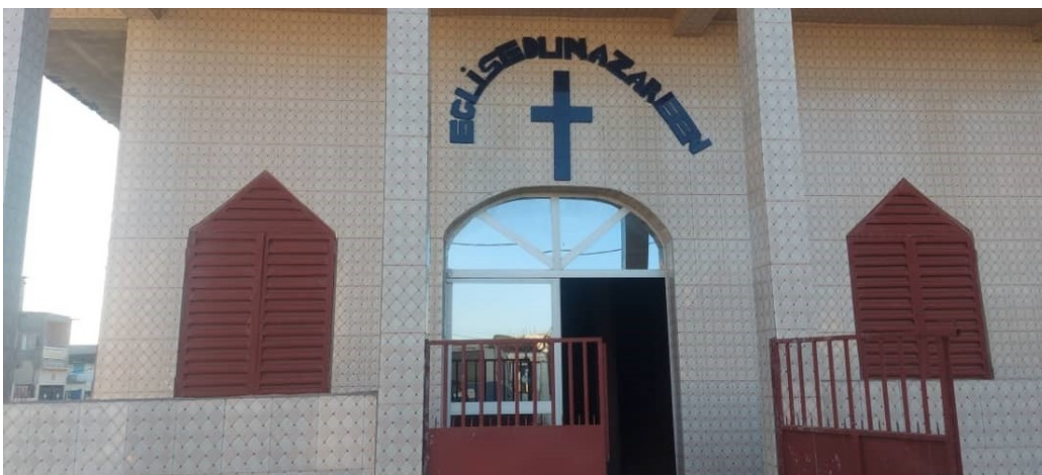
Church of the Nazarene in Goumel-Ziguinchor