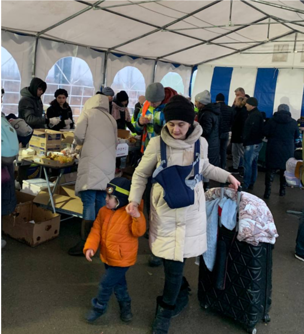
Checking in to a safe space.

As the world watches anxiously while the now-year-long war in Ukraine is debated and discussed in the media, the people on the ground continue to suffer the tragedy of this conflict. Yet, there are many good things happening through Nazarene efforts to mitigate the suffering and continue the work of church and community development in Jesus' name. The following is an overview of Nazarene assistance throughout this year. To all who have contributed through faithful giving and extraordinary efforts to come alongside our Ukrainian churches, thank you!