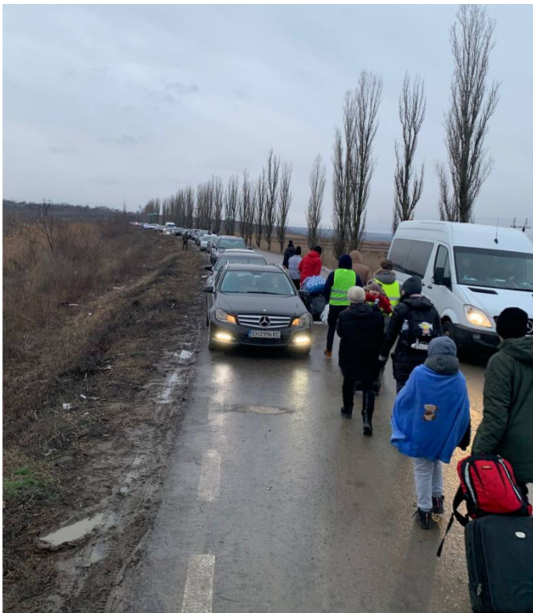
Preparing for a border crossing.