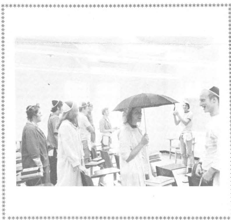
If Freshmen wonder where Sophomores found such beautiful ways of expressing their love during Rat Week, exam this picture of last year's "fun".

Let us allow Him to show His love through our lives, and we will have a great year.