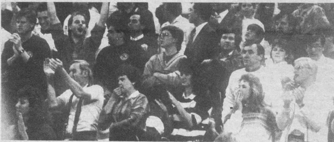
Many Trojan fans turned out in Kansas City to support their team. Excitement filled the air as the Trojans rumbled past their first two opponents.