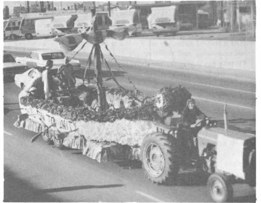
The first-place winning float was that of the Sophomore Class, pictured here on Murfreesboro Road.

This year's Homecoming was an excitement-packed weekend, something that will long be remembered by all Trevecca.