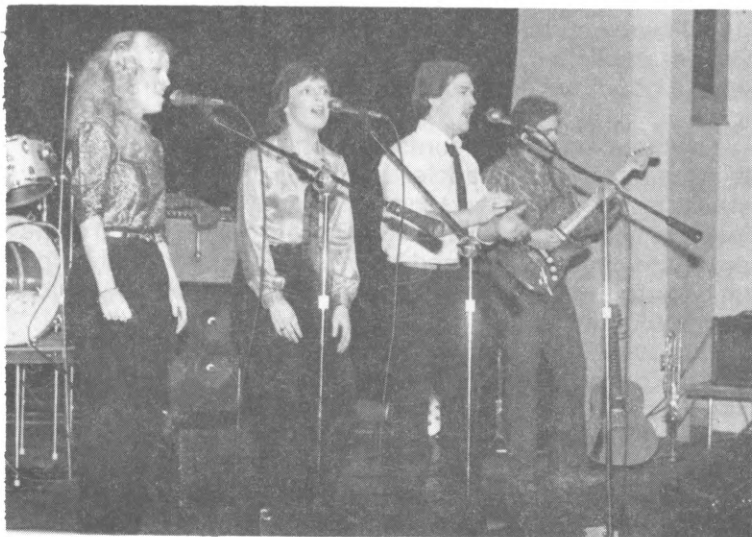
White Wing holds debut at Trevecca